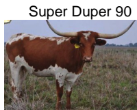
Super Duper 90