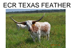
ECR TEXAS FEATHER